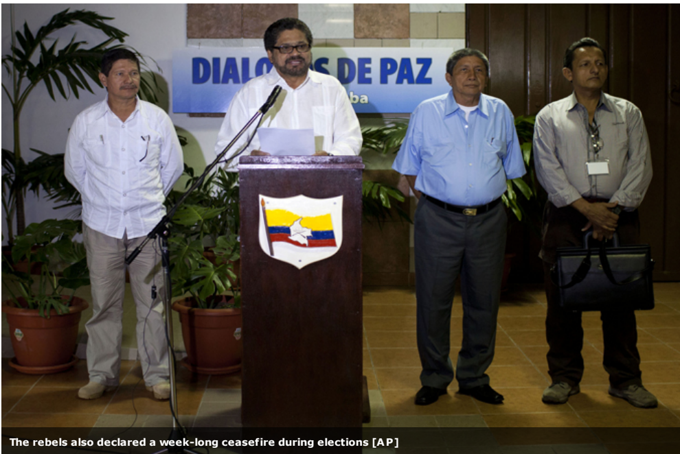
The rebels also declared a week-long ceasefire during elections