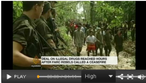
Colombia and FARC reach agreement to end drugs

President Juan Manuel Santos has staked his re-election campaign on peace negotiations. His closest challenger, Oscar Ivan Zuluaga, is running a hard-right campaign opposed to negotiations with armed groups.